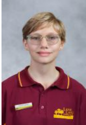
5/6S - Amberly